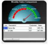
Weekly Sales Comparison